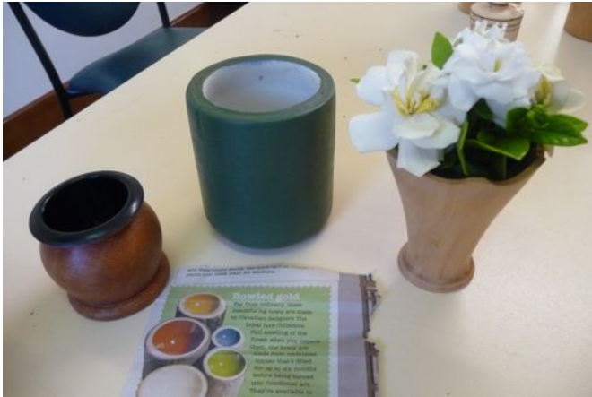
Val's pots inspired by the article attached. Vase has scalloped the top edge. Nice touch with the flowers.