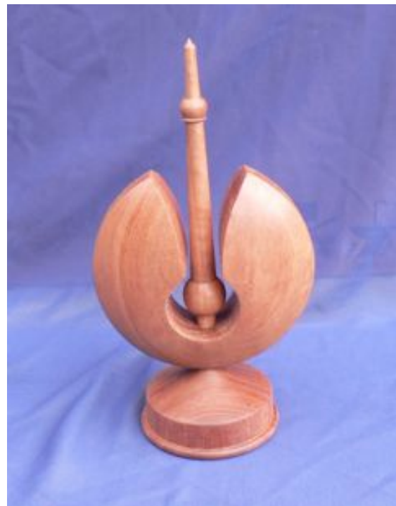
Design by Mal Jackson ( Rays prototype)