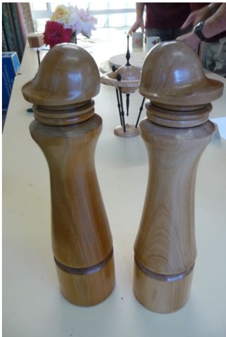
Set of salt & pepper grinders made from celery top. Crafted by Joe Walker