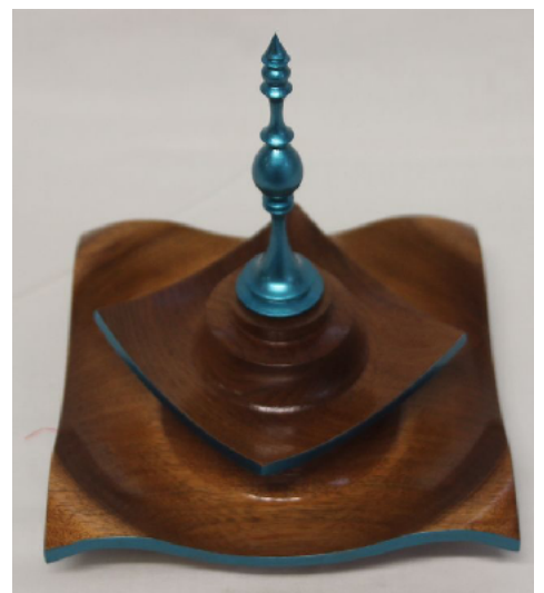
Graham Besley "Blue Poles"