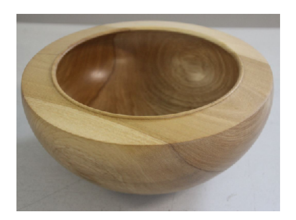
Above - A large bowl from "Junk wood" by Murray Round

Below - Blue Gum bowl with a danish oil finish - Bruce Black