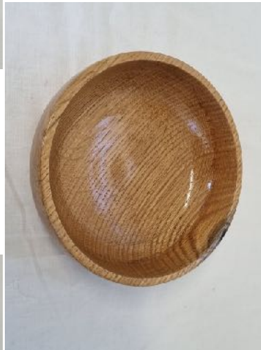
Gary Jenvy also had 2 bowls both finished with Danish Oil. Below is a French Oak bowl that was very dry to turn