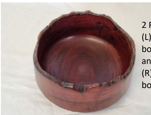
2 Red Gum Bowls (L) Roger Annells, a natural edge bowl finished with danish oil outside and a food safe oil inside (R) Alan Thompson's deep salad bowl finished with Danish Oil