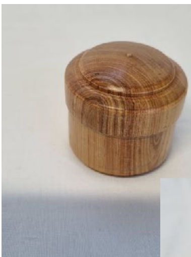
A lidded box shown by Tim Denyer. Finish is EEE and Wax