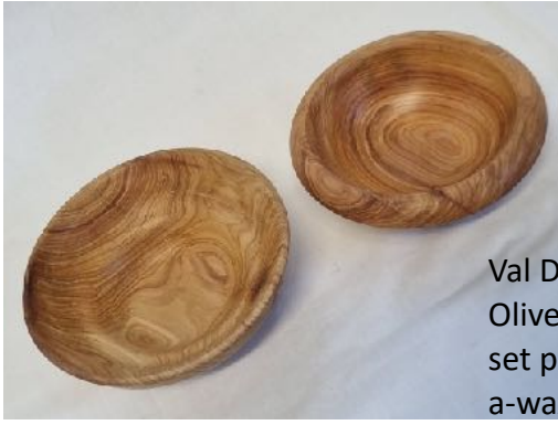
Val Dalsanto showed us 2 bowls from Olive, a small lidded container and an off set platter. All items finished with "Shell-a-wax"