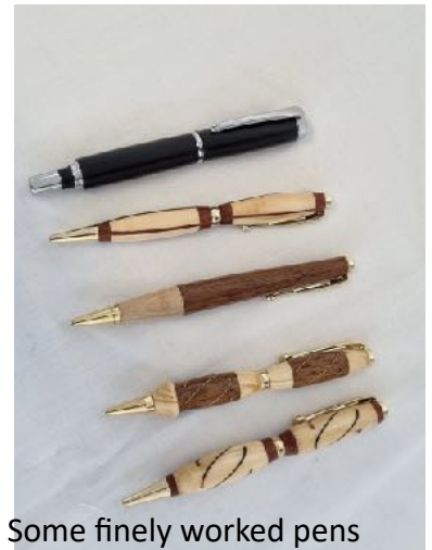
Some finely worked pens shown by Tom Beswick. Various timbers, finished with CA Glue