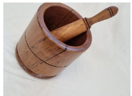
Roger Annells restored a 60 year old Mortar and Pestle. The mortar was badly split in 2 places. The cracks are filled and repaired and the whole lot was finished with Danish Oil