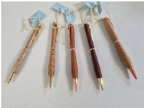
Some of the pens made by our members Well done to all involved

A big thanks to all our members who participated in this years pens for the troops. Gary was able to deliver 60, beautifully, made pens to the organisers who will pass them out to the troops on Anzac Day.