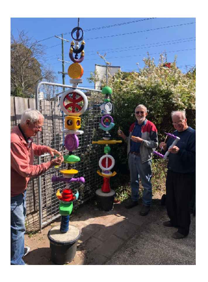
The finished Totems look very spectacular in the garden. Next time you are at the shed, visit the Totems