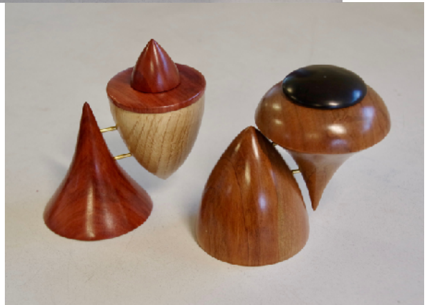
And 2 Artistic Lidded Container made from Redgum and Oak with Danish Oil finish