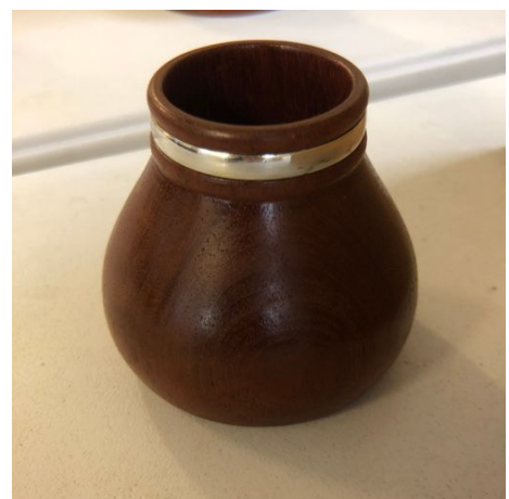
Cliff Walsh showed us a bowl from Cotoneaster and a hollow form from Red Cedar with an Aluminium ring, both finished with Acrylic

Val showed us some hollow for pieces and a lidded container