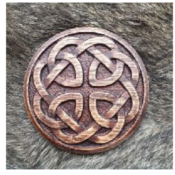
SOME RELIEF CARVING

At the October Meeting please bring along a piece of your wood turning with some added carving and/or embellishment to your turning.