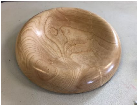
Two pieces from Neale Rees. Large Platter/ Bowl from Claret Ash.