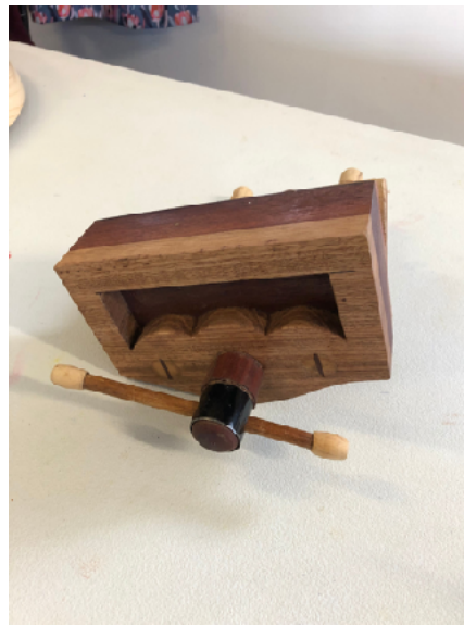
Max Lehmann showed a wooden Vice with a threaded drive shaft to open and close the vice