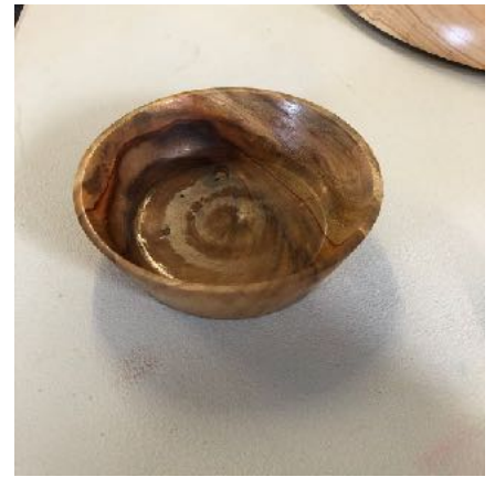
Small bowl (right) is an unfinished piece made from Camphor Laurel