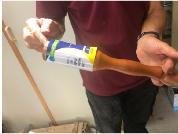
Members busy making their pieces for the lint remover